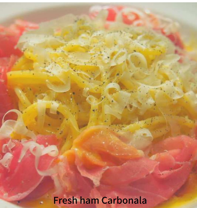
Fresh ham Carbonara