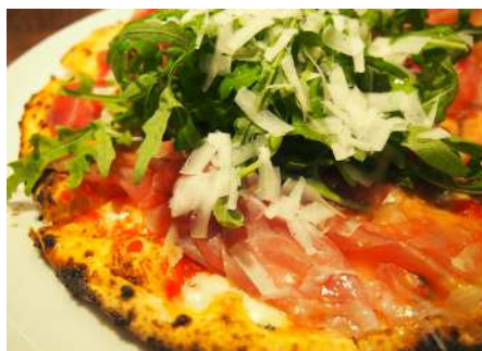
Prosciutto e rucola