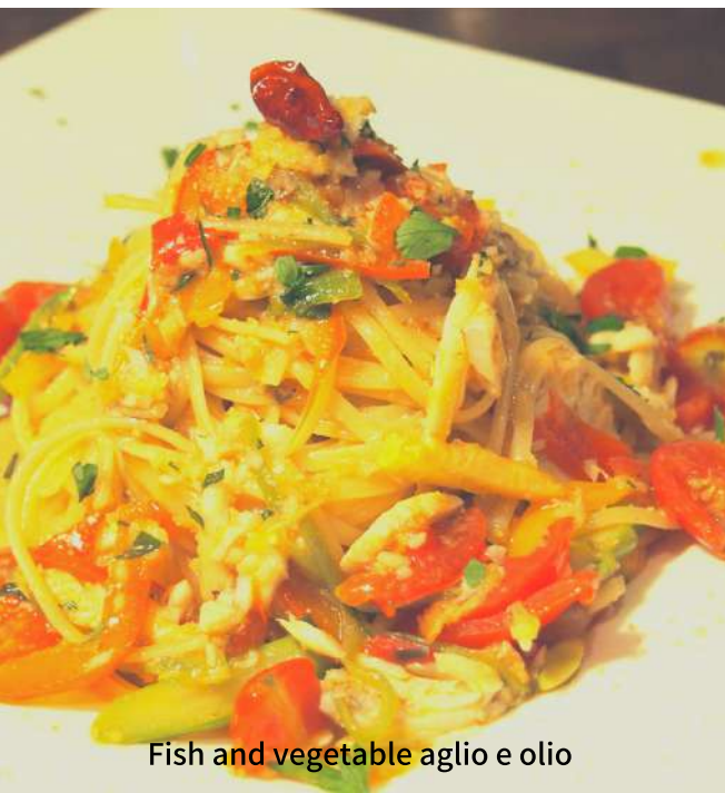
Fish and vegetable aglio e olio