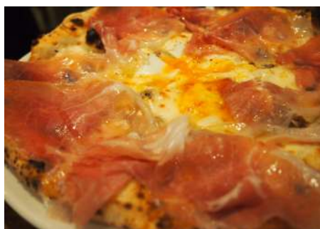
Fresh ham Bismarck

S ¥1,950 L ¥2,350 (+tax ¥2,145) (+tax ¥2,585)