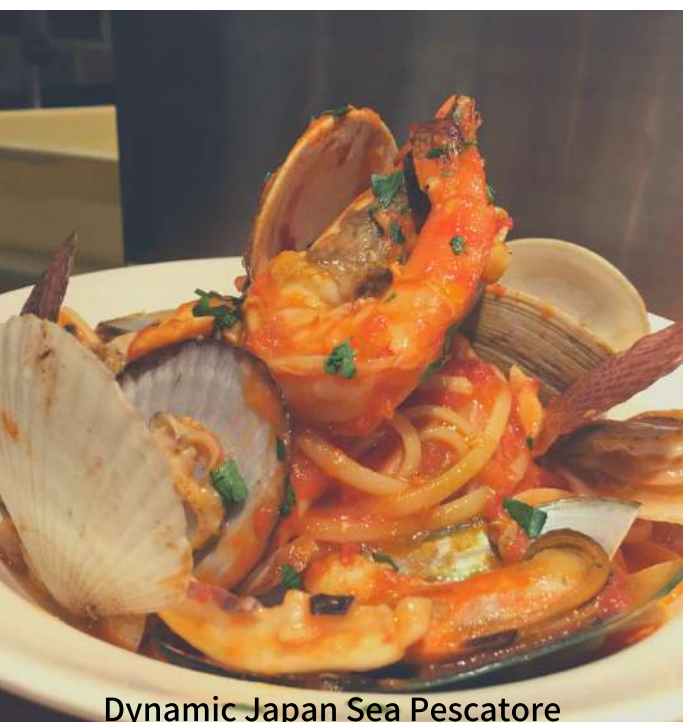
Dynamic Japan Sea Pescatore