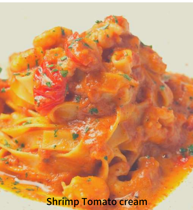
Shrimp Tomato cream