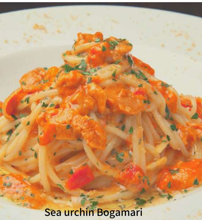
Sea urchin Bogamari